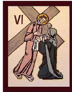
A woman, Veronica, wipes Jesus' face.

Has it been awhile since you attended Stations? Don't worry! We will help you through. We