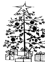
The Giving Tree