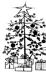
The Giving Tree