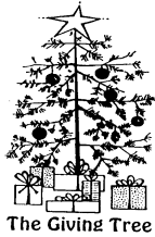
The Giving Tree

Our annual delivery of Giving Tree Gifts will take place as follows: